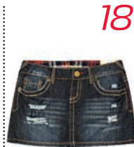
1 hot hunnie hits the scene in a denim mini from Amethyst Jeans. $30 (0-24)