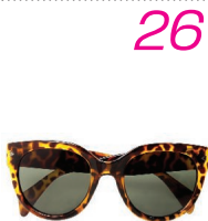
10 cool cuties go glam in Lulu's Rays the Roof yellow tortoise sunglasses. $9