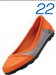
3 are walkin' on sunshine in Chooka's Nobotana Zig skimmers. $65 (6-10)