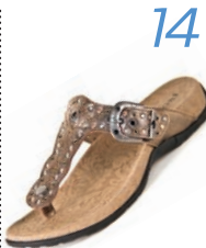
3 blinged-out babes shine in rose gold Siren sandals from Taos. $110 (6-11)