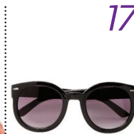
10 gals kick it old school in a pair of 24-Seventies sunglasses from Lulu's. $9