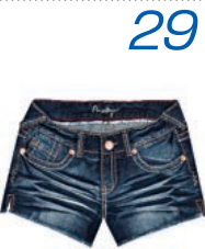
1 true blue wins a pair of Aggie denim shorts from Amethyst Jeans. $30 (0-24)