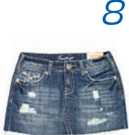
1 flirty femme will frolic in a denim Dylan mini from Amethyst Jeans. $30 (0-24)