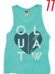
5 rebel in this Outlaw Easy Rider tank from Junk Food Clothing. $32 (S-XL)