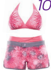
5 adore Dry Dudz's hybrid bikini top and shorts. $90 (Top: A-D cup. Bottoms: 00-12)