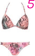
10 will walk on the wild side in this Island Safari bikini from Gossip. $66 (S-L)