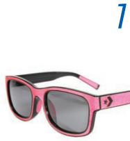
10 sunny sistahs slip on Converse's On Your Mark sunglasses in neon pink. $69

TO ENTER • Log on to girlslife.com • Look for the WIN TODAY box • Click on the prize and enter • Check the WINNERS' LIST each Friday • ENTER AS MANY TIMES AS YOU WANT! • U.S. residents only.