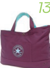
5 beach bums bag a plum-perfect tote from Converse Accessories. $40