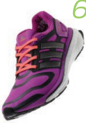
5 pretties perk up in a pair of adidas Energy Boost sneakers. $150 (6-11)