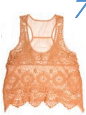
5 crush on this crotchless top d'esprit tank from Almost Famous. $15 (S-L)