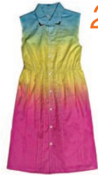
6 hippie chicks hit the beach in a tie-dye tank shirt dress from Ali & Kris. $35 (S-L)