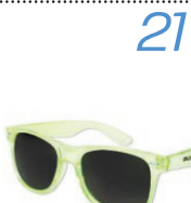
5 bright-eyed belles snag a pair of clear lime sunglasses from Sugar and Bruno. $5