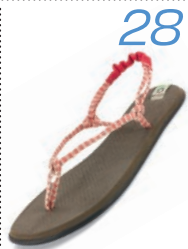
5 island hoppers heart these Rasta Knotty sandals from Sanuk. $40 (5-11)