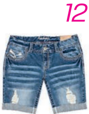
1 gal goes long in Caitlyn denim Bermuda shorts from Amethyst Jeans. $30 (0-24)