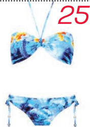
10 are boardwalk-bound in Gossip's Absolutely Shore bandeau bikini. $64 (S-L)