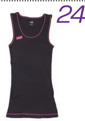
5 beat the heat wearing Soffie's Contrast Thread Boy-Beater tank. $10 (XS-XL)