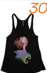
5 flip their fins for a Mermaid tank from Sugar and Bruno. $28 (XXS-XL)