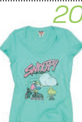
5 keep it casual in a Snoopy vintage tee from Junk Food Clothing. $32 (S-XL)