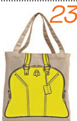
5 readers feel like a princess when they nab this Kate bag from My Other Bag. $30