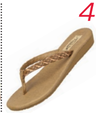
5 will flip for this new twist on a summer staple: Flojos' Twist flip-flops in gold. $36 (5-11)