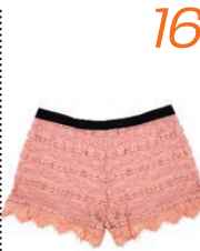
5 girly girls go for frills in these blush lace shorts from Sugar and Bruno. $32 (XS-L)