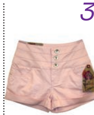
10 shorties score a pair of High Rise Shimmer Shorts from Wallflower Jeans. $40 (0-14)