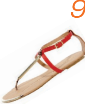
10 chill in Wild Diva's Lounge Tabiana orange and gold thongs from Lulu's. $17 (6-9)