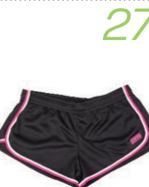
5 good sports hit the field in a pair of Lacrosse Shorty shorts from Soffie. $15 (XS-XL)