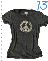
2 starlets keep the peace with this T-shirt from Starr Luna. $42 (S-XL)