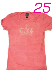
2 queenies rule the school with this Starr Luna crown tee. $42 (S-XL)