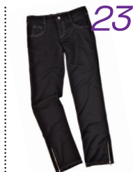
1 can sit pretty in Supergirl by Nastia's knit skinny pant with a $35 gift card to JCPenney.