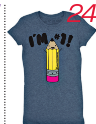
20 can pencil in wearing this David & Goliath "I'm #1!" tee. $20 (S-XL)