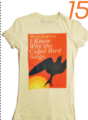
5 bookworms bring back a $33 online gift code to outofprintclothing.com.