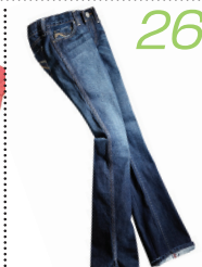
3 girlies grab these jeans from Ariat Denim. $70 (25-32 regular, long, extra long)