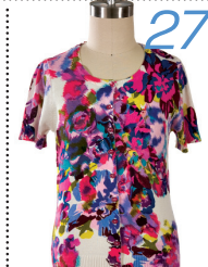
1 gets Charlotte Tarrantola for Girls' Elixir cardi in Lotus. $79 (Girls 7/8, 10/12, 14/16)