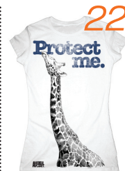
5 get wild with this Animal Planet tee, available at Delia's. $25 (M)