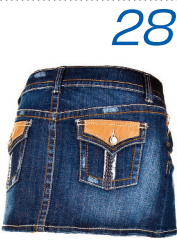
1 eco-savvy sweetie wins this REUSE REBOUNDED skirt from World of Green. $75 (24-31)