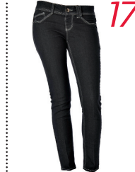
5 gals get a leg up on fashion with Jolt's denim legging pick-me-up. $39 (1-13)