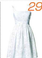
1 outdoorsy lady will totally dig this mark. garden party dress. $32 (S-XXL)