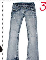
14 denim divas slip into a pair of these true blues by Amethyst Jeans. $44 (1-13)