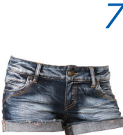
5 fall for these Love Spell shorts from Celebrity Pink Jeans. $30 (1-11)