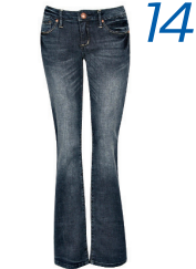
5 denim divas will look hip in these jeans from gojane.com. $17 (3-13)