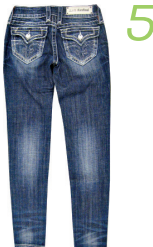
3 rockin' mamas score a pair of Celine SK 03 jeans by Rock Revival. $158 (25-31)