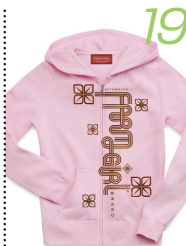
10 will be home in Farm Girl Brand's fitted zip-up hooded sweatshirt. $32 (Juniors S-XL)