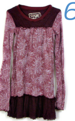
4 bloomin' babes will blossom this fall in a dress from Erge. $61 (S-XL)