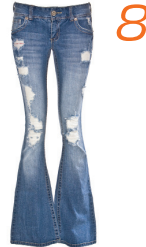
5 score a pair of jeans of their choice (up to $37) from debshops.com. (Juniors 0-24)