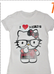
10 smarties will hit the books in a Mighty Fine Hello Kitty Nerdy tee. $22 (S-XL)