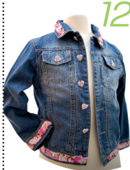
1 gal customizes her own FashionPlaytes Payton denim jacket. $75 (Girls 8, 10, 12)