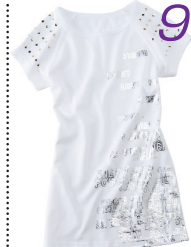
1 will fly in this Supergirl by Nastia studded raglan tee with a $30 gift card to JCPenney.