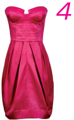
10 will be the belle of the homecoming ball in this dress from lulus.com. $49 (S-L)