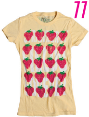
5 will look berry cute in this Lords of Liverpool Strawberry Fields T-shirt. $30 (S-L)