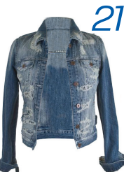
5 retro-rad chicas collect this denim jacket from Vintage Havana. $69 (S-L)