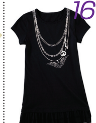
1 girlie can grab this Supergirl by Nastia ruffled tunic with a $40 gift card to JCPenney.