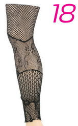
10 put their best foot forward in patchwork fishnet footless tights from K. Bell. $15