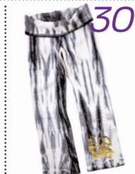
1 gets Supergirl by Nastia bamboo print pants with a $35 gift card to JCPenney.