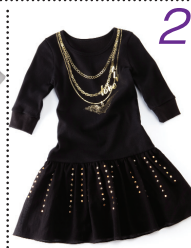
1 will flip for Supergirl by Nastia's necklace dress with a $35 gift card to JCPenney.